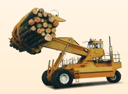
Forestry Harvesters and Skidders

Use the link above to visit Graco.com and select the G-Series Pump/CSP Valve Kit to fit your off-road equipment.