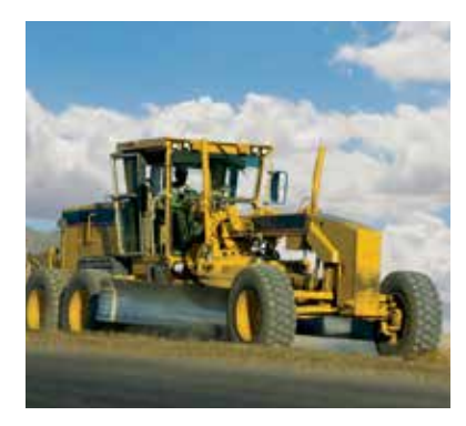
Graco automatic lubrication packages give you a competitive advantage