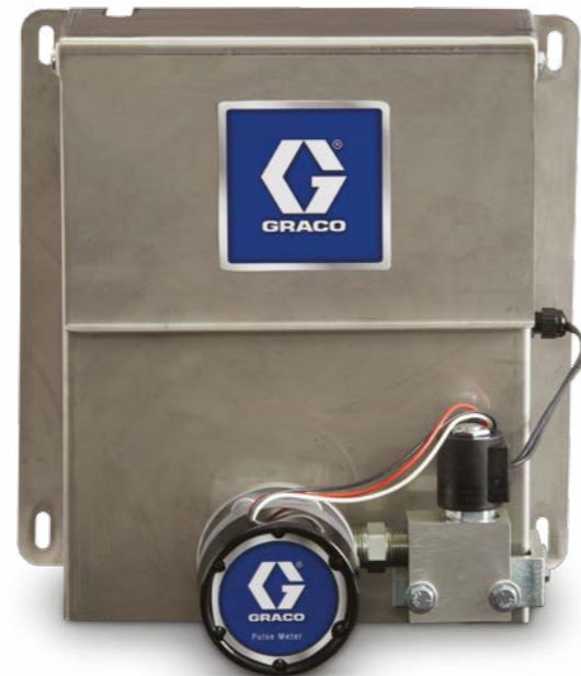
Oil or Water Fluid Panel