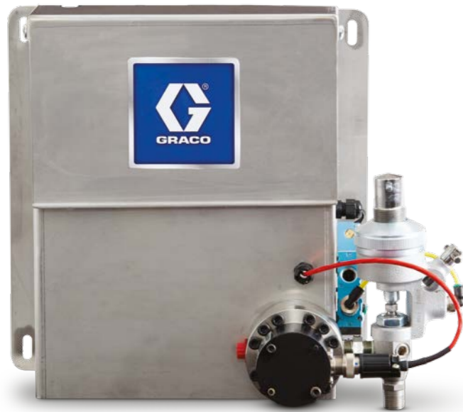
G3000 Grease Fluid Panel

Whether managing a single fluid or up to eight, ProDispense gives you total control of each one.