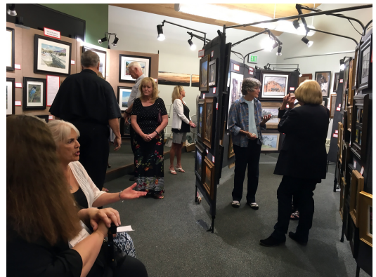
Visitors mingle with the artists.