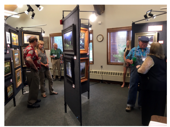
Volunteers did an awesome job setting up the panels and the lights for the artists to display their paintings.