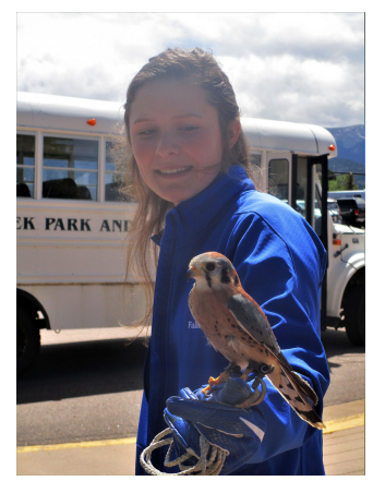
An AFA cadet brought one of their Kestrel Falcons to the Park.