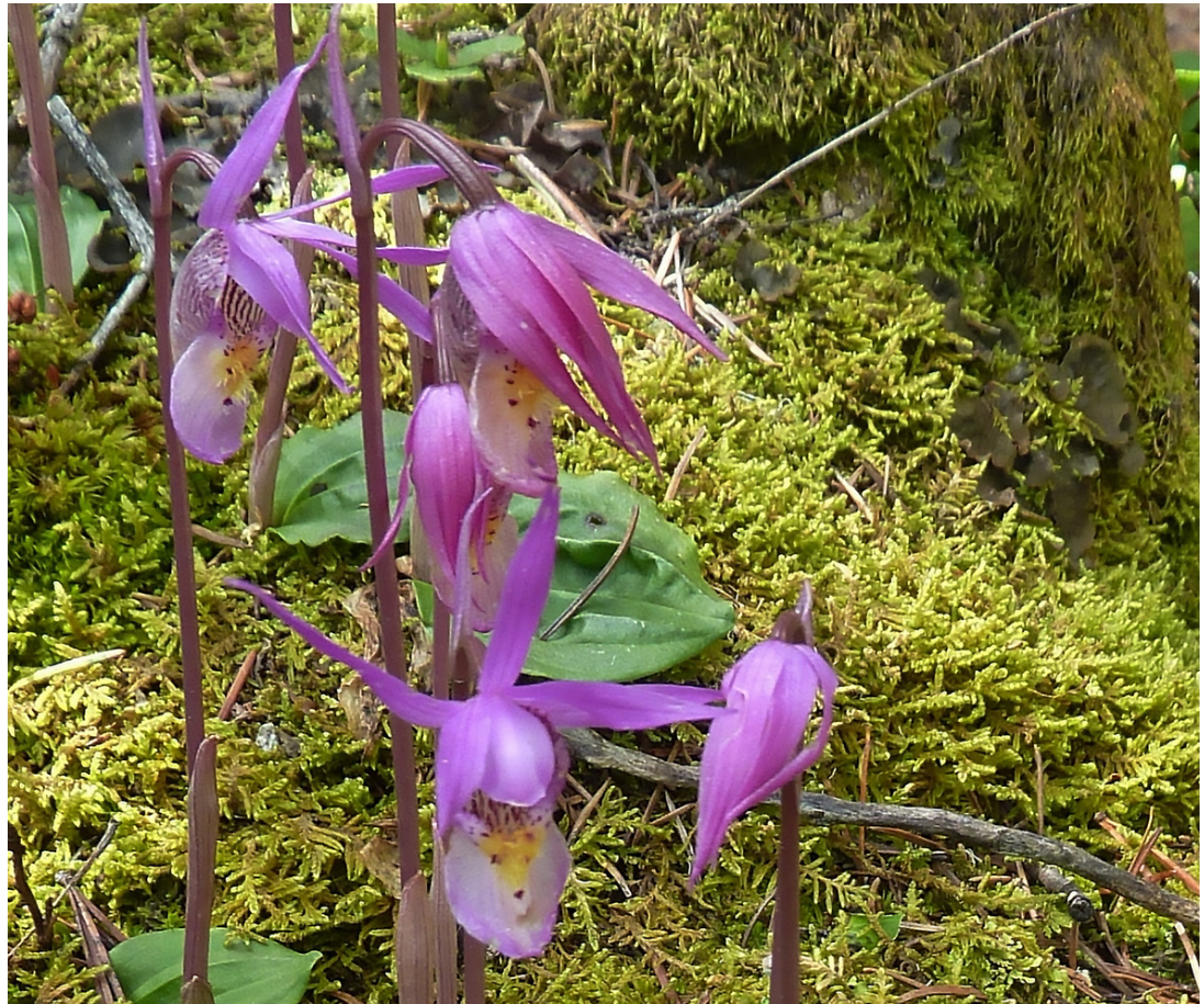
Mueller State Park does have Calypso orchids. They bloom towards the end of June. Being only 4" tall, they are easy to miss.