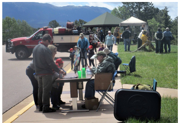
The Divide Fire Department allowed children and adults to check out their equipment. Others played "Wildlife Trivia", one of the many interactive games setup for our visitors to enjoy.