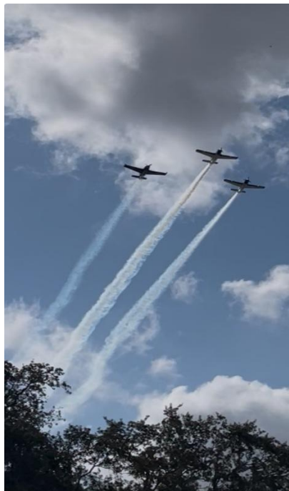
A close-up of the T-34's from the Veterans Airlift Command.