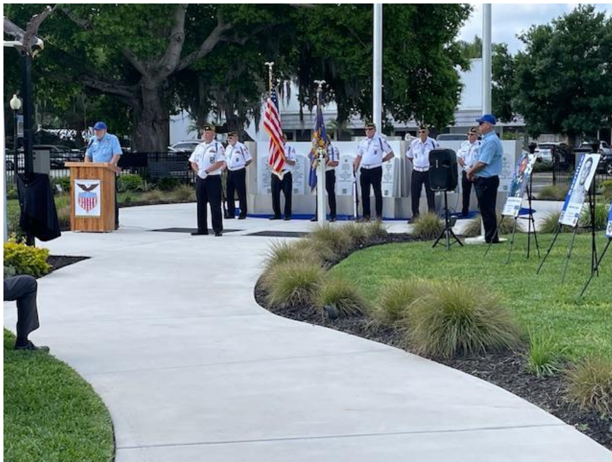
VFW Post 4300 Honor Guard