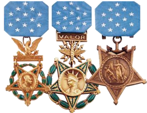
Army Air Force Navy