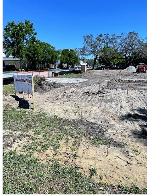
On the left a look at the prep for the location of the memorial and on the right the location of the sign and a view from Commerce Street (Eucalyptus is on the left).