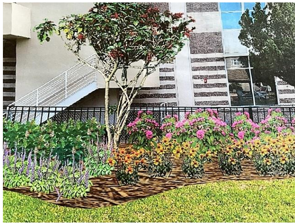
Conceptual ideas for the main gate on Commerce as well as the fence and landscaping that will be on site.