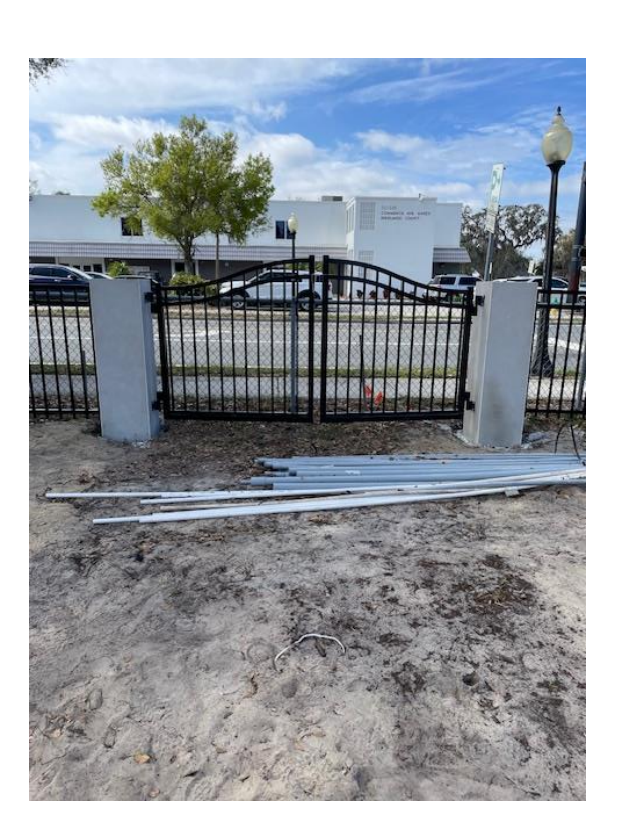
These photos show some of the aluminum fencing installed by the North American Fence Contractors Association, as well as some of the 29 columns after the stucco was applied. Later we will install caps on the tops of the columns. The gate is the "main" entrance on Commerce Street.