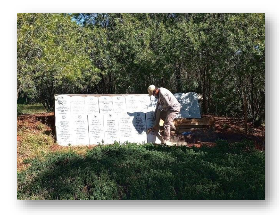
Markers being prepped for removal from the old venue by the Highlands County Veterans Services Office. Buxton-Bass Funeral Home is doing this pro-bono!