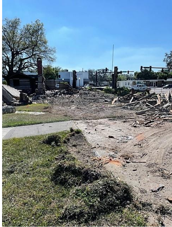
The old Girl Scout cabin—one last look before the machines do their tricks.