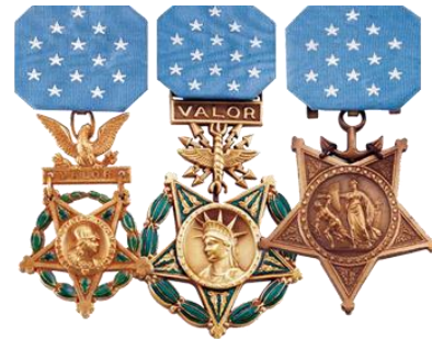
Army Air Force Navy