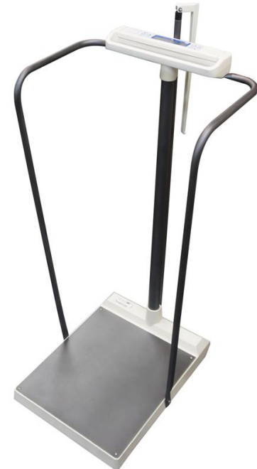
(Shown with optional handrails and height bar)