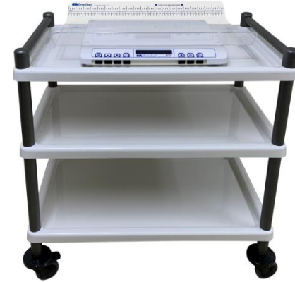
(SRC-600 shown with SR615i pediatric scale. Scale not included)