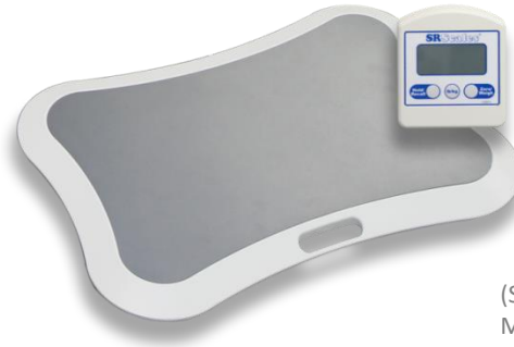
(SR411i – Wired Wall Mounted Display)