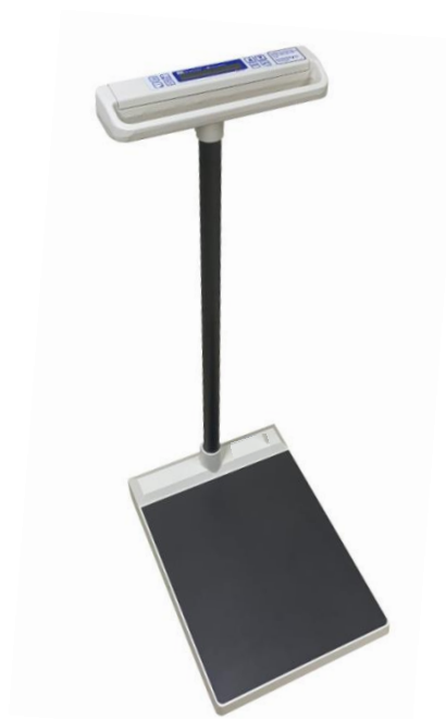
(Shown without optional handrails and height bar)