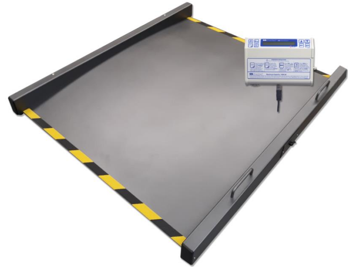
Platform Size: 32" x 40"