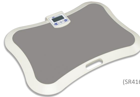
(SR416i – Built-in Display)