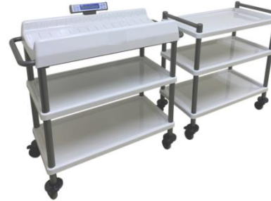
(SR-635i shown with SRC600)