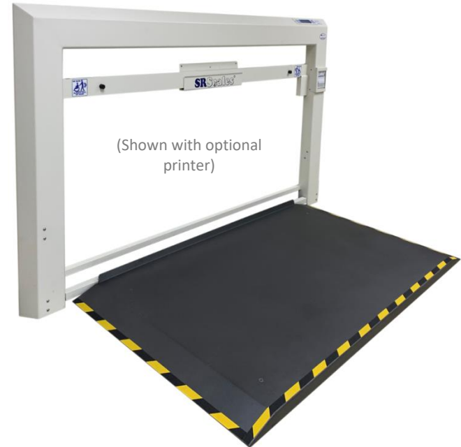
Platform Size: 38" x 58"