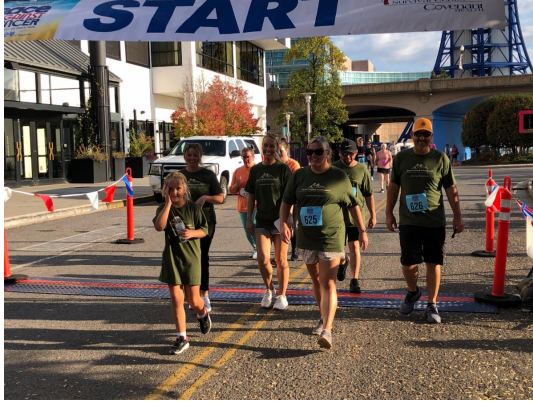
CROSSING THE FINISH LINE