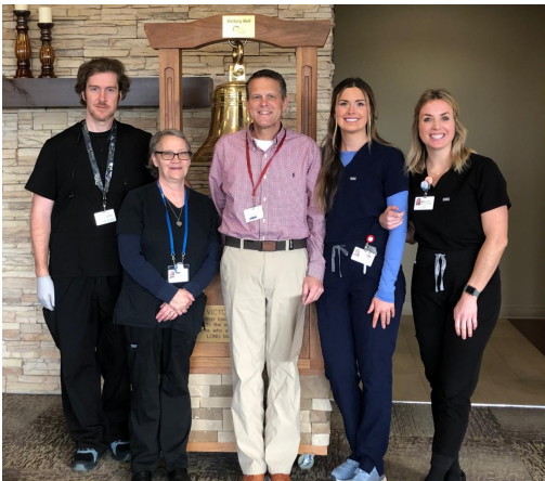
My team of Avengers at Thompson Proton Center