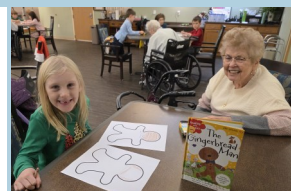
Pictured: Visits to Milestone Senior Living- Tomahawk.