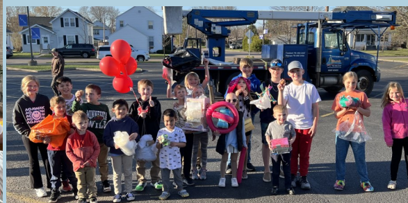
Pictured: Students attending monthly Adoration and our Family Egg Drop Science Night.

The numbers are all coming in and it looks as if this is our biggest profit ever on both Time and Treasure and Gala! Thank you all for your support of donations, sponsorships and prayers. God is good!