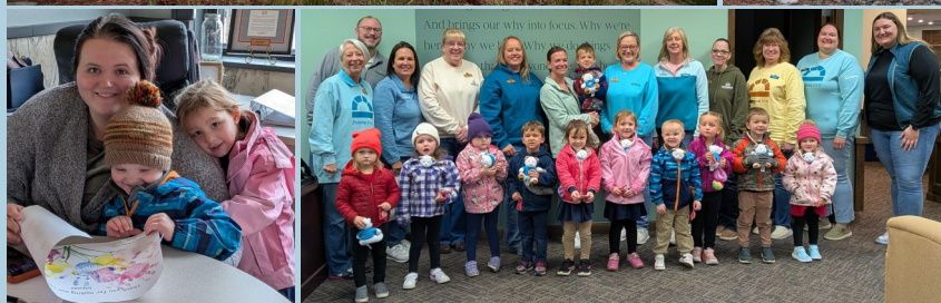
Pictured: The crowning of Mary and the Preschool class visited Crossbridge Community Bank and other businesses for May Day.