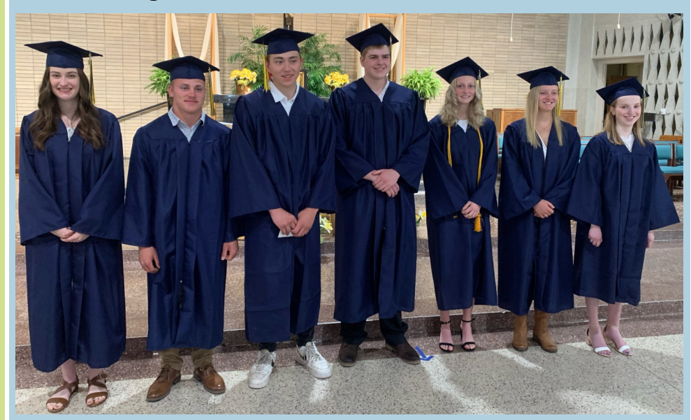
Congratulations to our High School graduates!!! Blessings on you as you continue your next adventure!