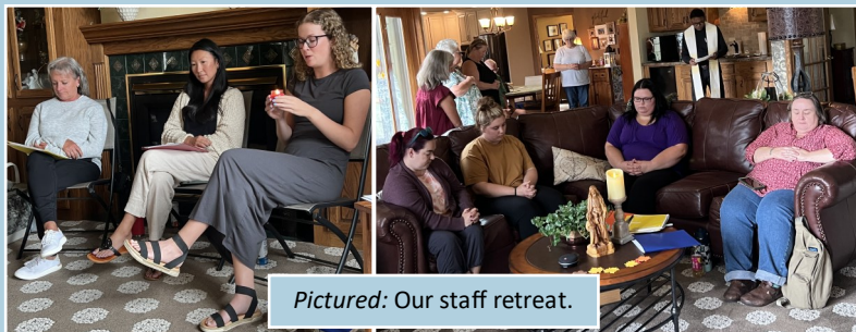
Pictured: Our staff retreat.

Please feel free to stop at Simply Stitched downtown and/or visit online simply-stitched-llc.myshopify.com to order our school clothing!