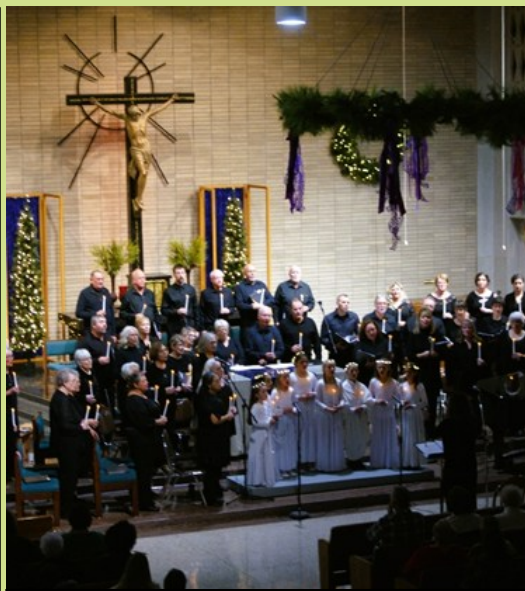
Advent Concert 2024