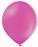
Magenta - 26