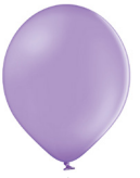
Lavender - 32