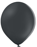
Dark Gray - 28