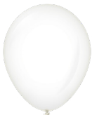
Clear - 38