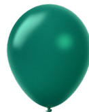
Green - 69