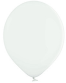
Opal white - 01