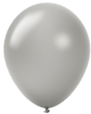
Silver - 62