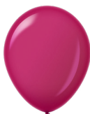
Burgundy - 35