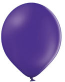
Dark Purple - 14