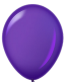
Purple - 34