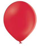
Warm Red - 04