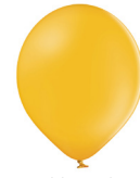
Goldenrod - 27