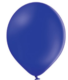
Navy Blue - 13