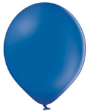
Royal Blue - 09