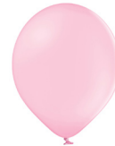
Pastel Pink - 17