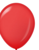
Ruby Red - 41