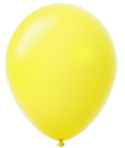
Yellow - 54