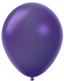
Purple - 70