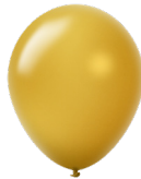
Gold - 61