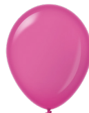
Fuschia - 43