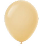
Peach - 16