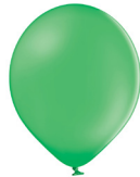
Summer Green - 18