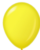
Canary Yellow - 02