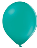
Aqua - 23