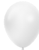
White - 51