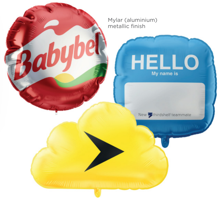
Mylar (aluminium) metallic finish