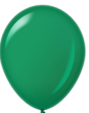
Emerald Green - 11