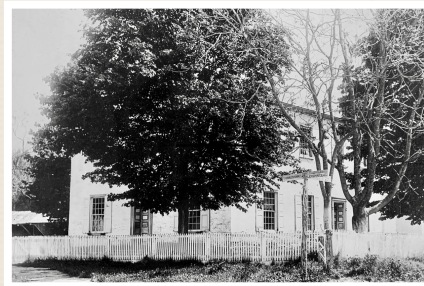
Ridge Valley Union Church 1854-1901