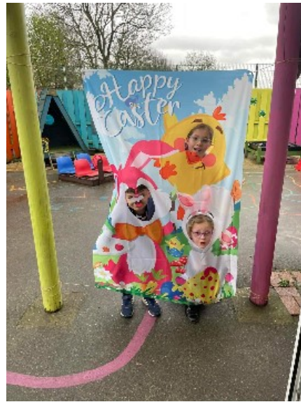
Left: Fun at our Easter Egg Hunt