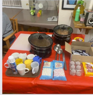
Fireworks Display with friends and family 2022