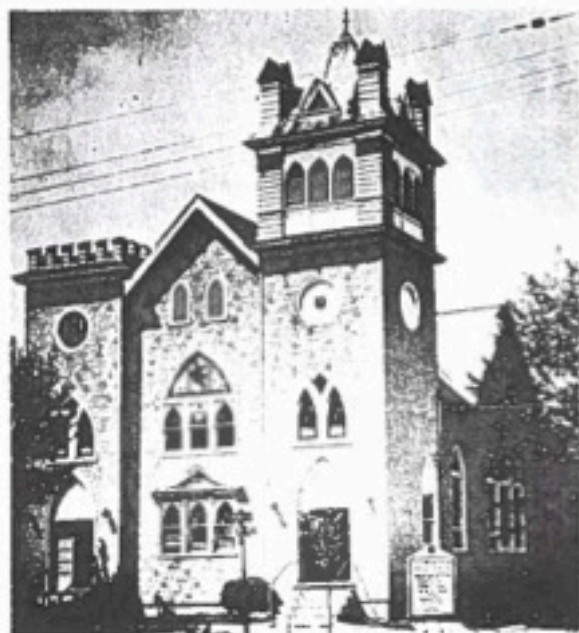
OUR FORMER CHURCH