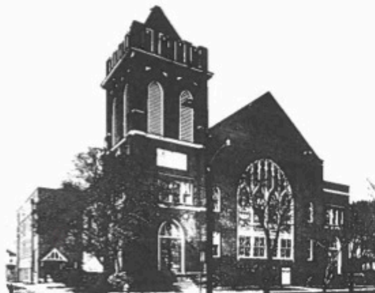
45th Street and Parker Avenue Norfolk, Virginia