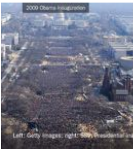
2009 Obama Inauguration

absentee ballot candidate caucus deadline debate democrat election fact check mail-in polling place president primary process registration republican senate vote