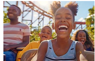
Memorial Day – May 25th