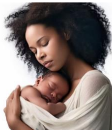
Mother's Day – May 10th