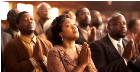
National Day of Prayer – May 7th