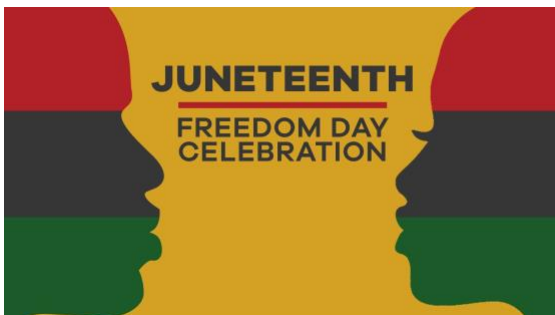
Juneteenth – June 19th