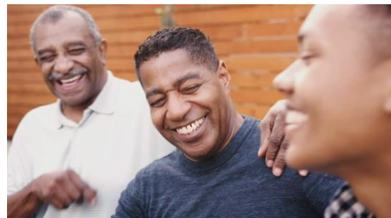
Father's Day – June 21st