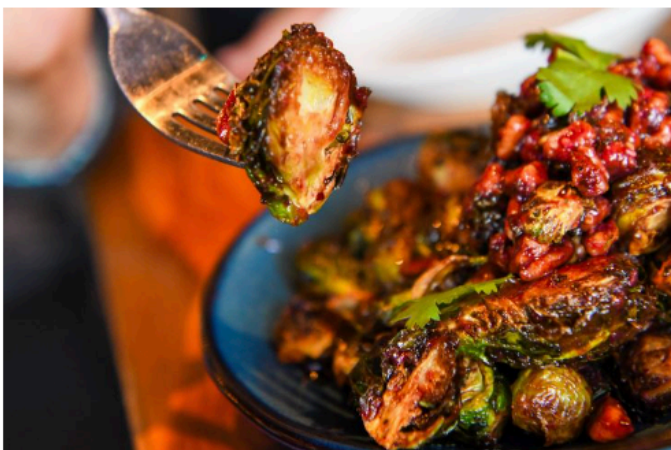
Black & Blue Brussels

For starters, let's talk about The Parish's incredible Black & Blue Brussels—perhaps the most unexpectedly delightful twist on Brussels sprouts you'll ever encounter. Hats off to The Parish for turning Brussel sprouts into a dish that we now crave endlessly. So, what's the secret? It's all about the layers of flavor they bring to the table. Picture this: candied pecans add a sweet, buttery nuttiness that perfectly contrasts with the peppery vibrancy of cilantro. And just when you think it couldn't get any better, they top it off with an award-winning house-made black-and-blueberry hot sauce. This sauce is a symphony of jammy sweetness from the berries, balanced with a tantalizing habanero heat that elevates every bite to new heights.