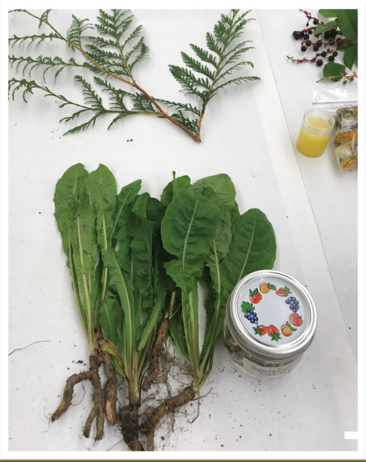
Kaasei Indigenous Foodways