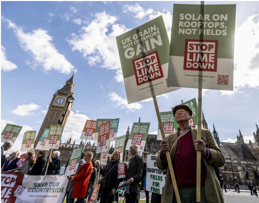
Lime Down Solar Park could power 115,000 homes in Wiltshire, but has divided the community

"There are only nine landowners in the whole scheme and most of them are neighbours we have lived alongside, so it's incredibly divisive," Fuller said. "There is a lot of bad feeling and it's caused a huge amount of resentment."