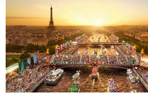
From a Swiss