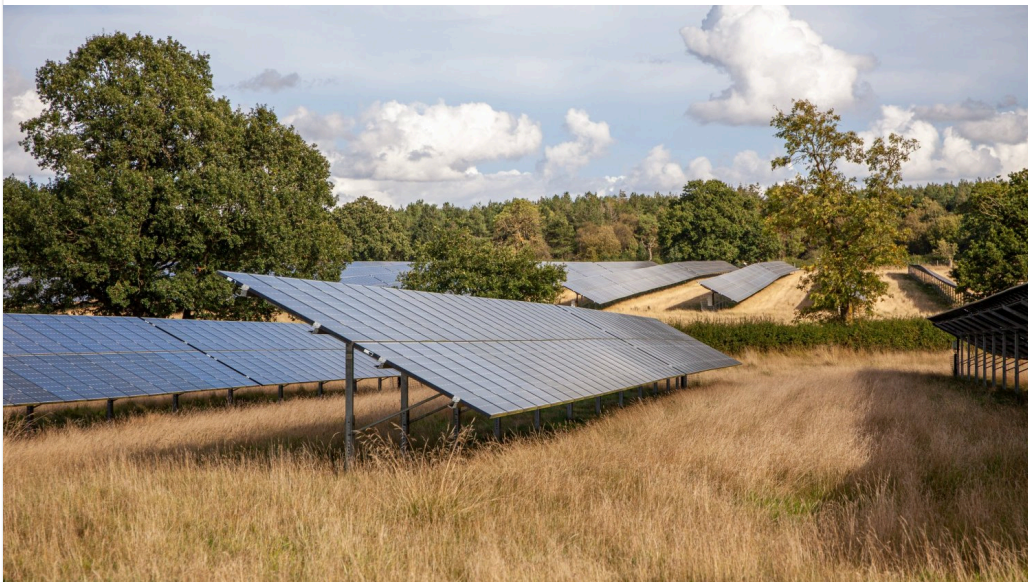
The proposed Lime Down Solar Park would cover swathes of agricultural land in north Wiltshire

The surge is being driven by cheaper technology, carbon targets and the return of government subsidies