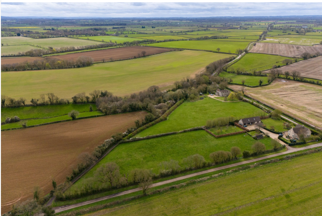
A view of the proposed Lime Down site in the Wiltshire countryside near Malmesbury and Sherston

However, Tom Lancaster at the Energy and Climate Intelligence Unit, a think tank, said sheep could benefit from grazing on land with solar panels by being protected from the heat. Moreover, he said the government's 70GW solar target by 2035 would see solar farms only cover 0.5 per cent of UK land. Even then, it would still be less than the land covered by golf courses today.