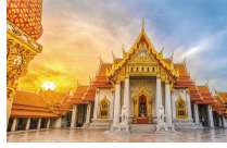
The ideal solar