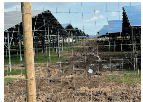
The first solar super scheme, the 900-acre Cleve Hill site, still under construction