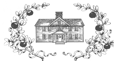
Home of Little Women