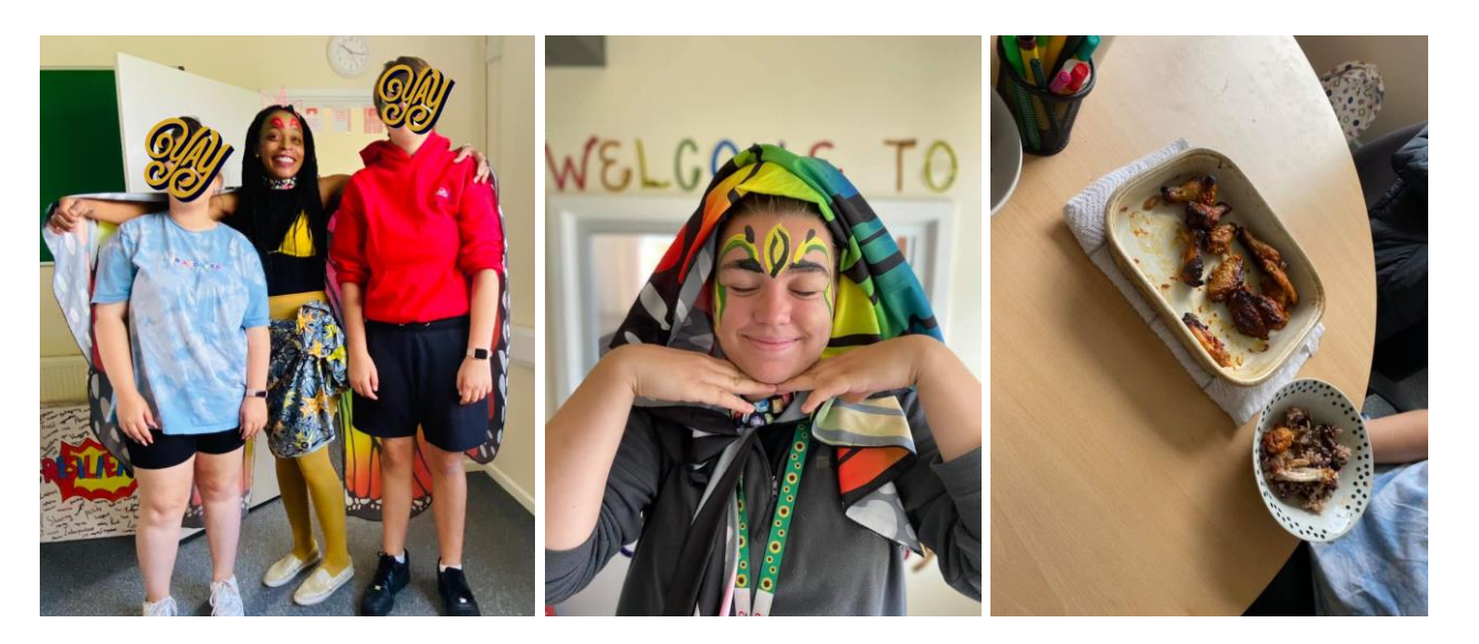
Memories were made on the 2^{nd} September 2020 where the carnival came to Clovelly. {\it CC} year 11.