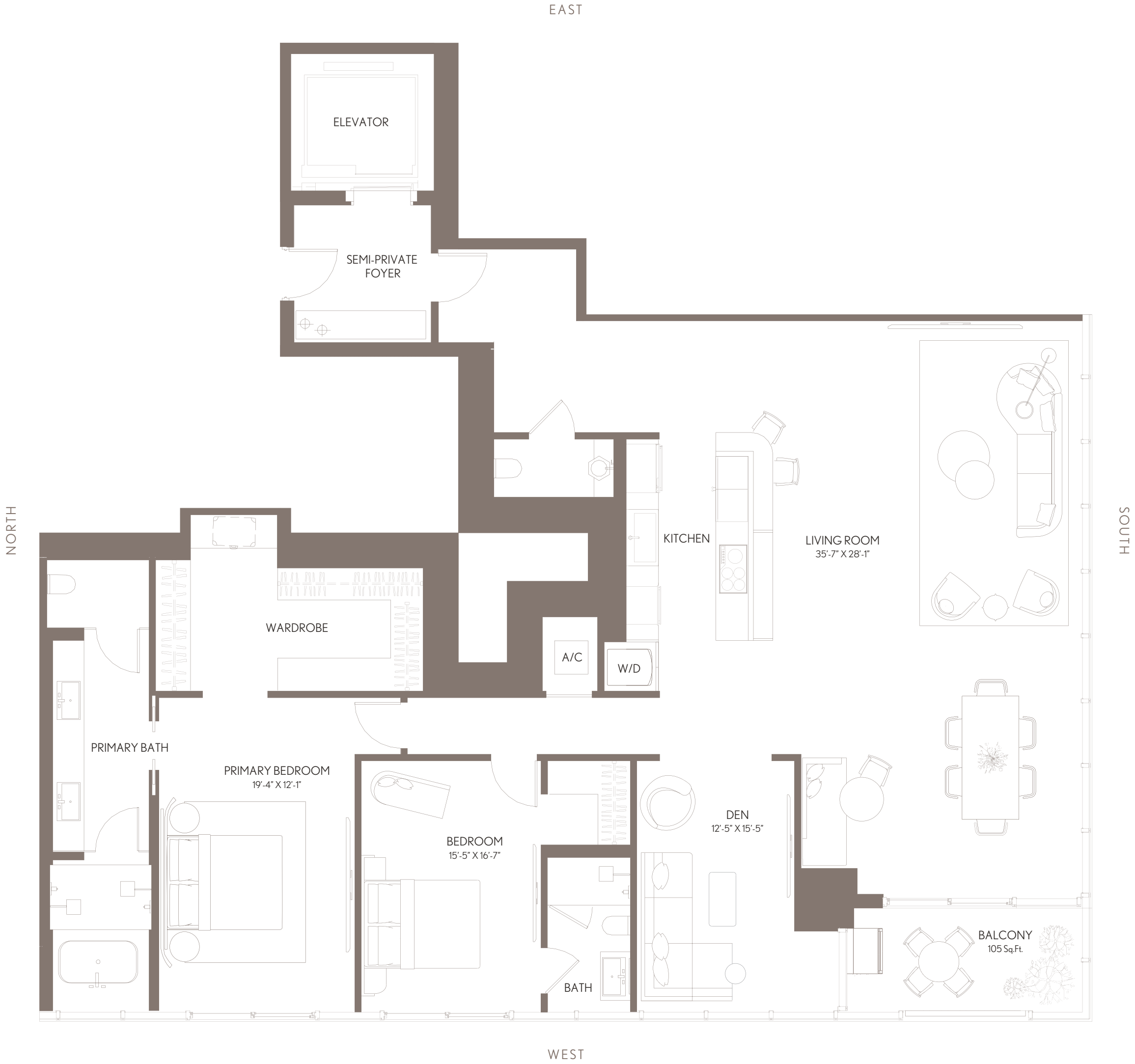
WALDORF ASTORIA RESIDENCES MIAMI

WALDORF ASTORIA IS A REGISTERED TRADEMARK OF HILTON INTERNATIONAL HOLDING LLC, AN AFFILIATE OF HILTON WORLDWIDE HOLDINGS INC. ("HILTON"). THE RESIDENCES ARE NOT OWNED, DEVELOPED, OR SOLD BY HILTON AND HILTON DOES NOT MAKE ANY REPRESENTATIONS, WARRANTIES OR GUARANTIES WHATSOEVER WITH RESPECT TO THE RESIDENCES. THE DEVELOPER USES THE WALDORF ASTORIA BRAND NAME AND CERTAIN WALDORF ASTORIA TRADEMARKS (THE "TRADEMARKS") UNDER A LIMITED AND NONEXCLUSIVE LICENSE FROM HILTON. THE LICENSE MAY BE TERM- NATED OR MAY EXPIRE WITHOUT RENEWAL, IN WHICH CASE THE RESIDENCES WILL NOT BE IDENTIFIED AS A WALDORF ASTORIA BRANDED PROJECT OR HAVE ANY RIGHTS TO USE THE TRADEMARKS.