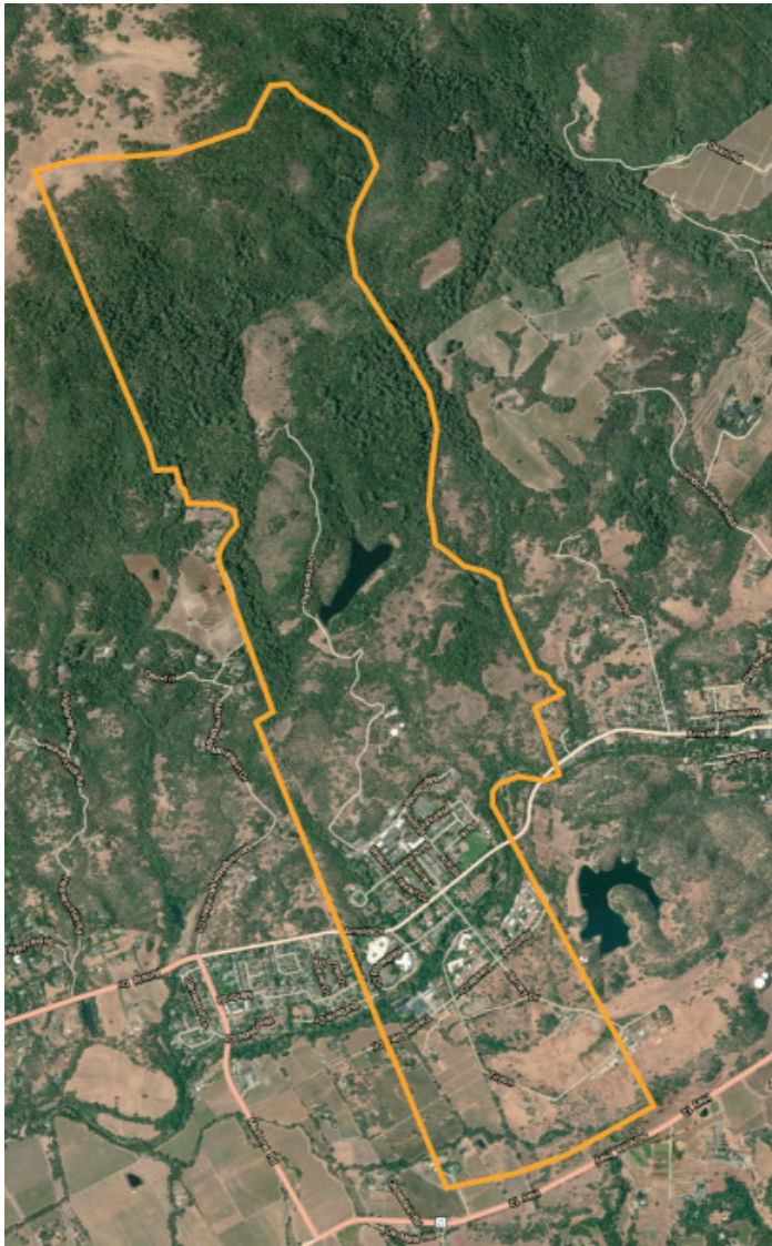
Historic boundary of Eldridge