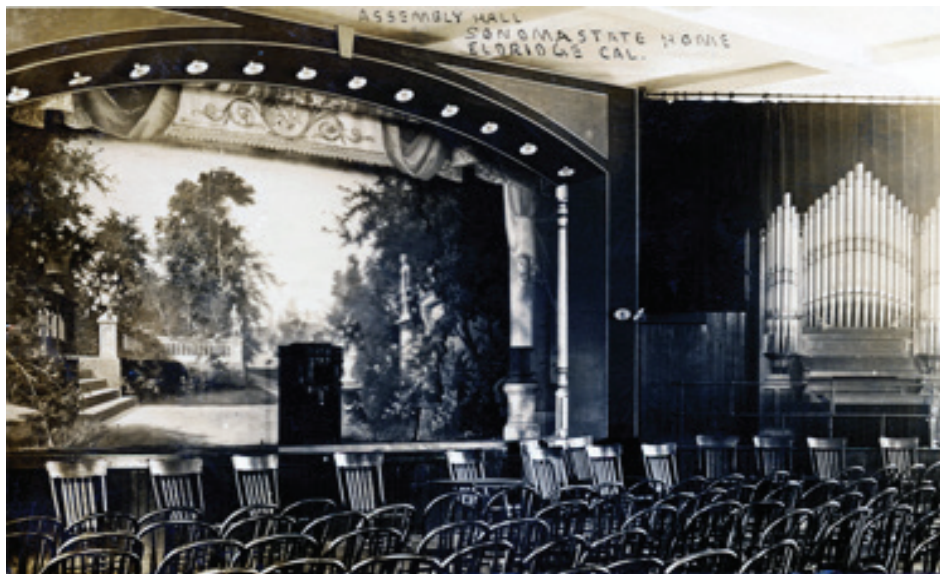
Original Assembly Hall