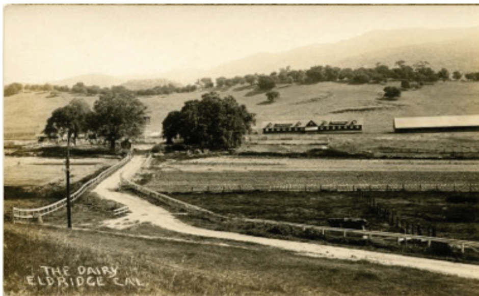
The Dairy, approximately 1910