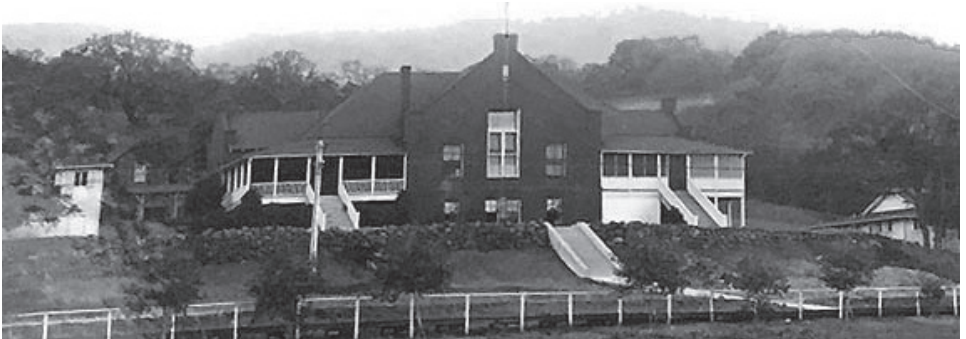
Original Hospital circa 1915