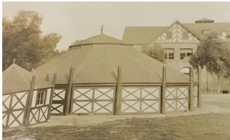
Original Carousel, 1922