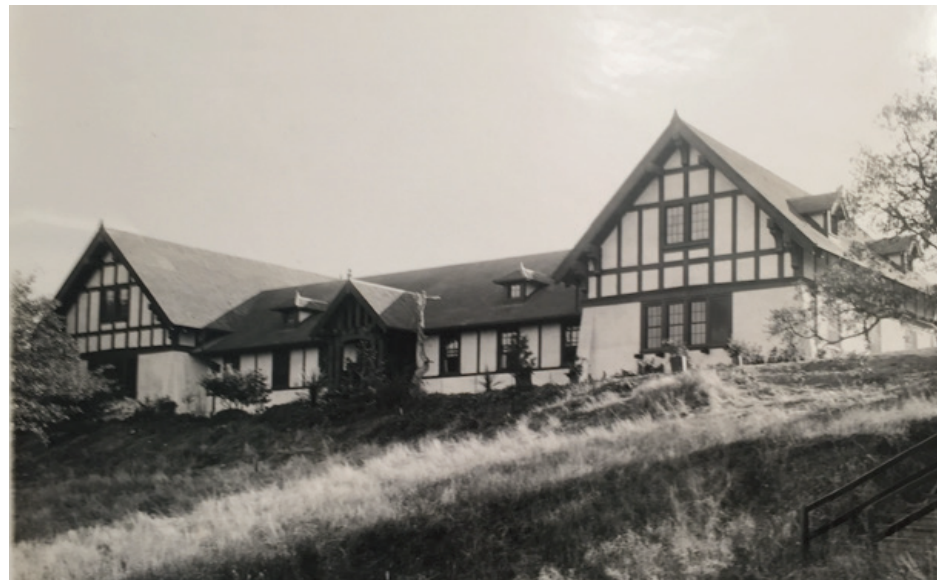
Laurel Cottage, 1907