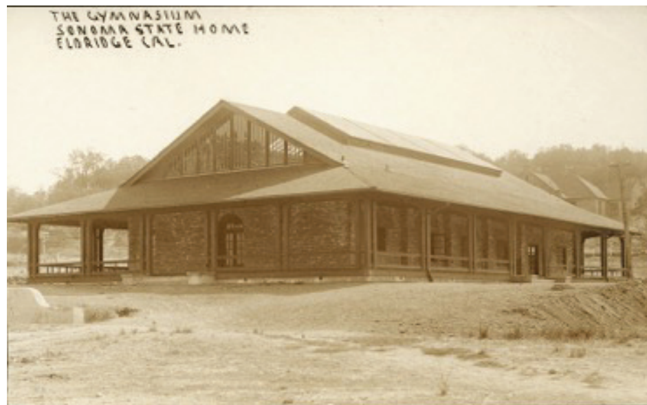
The Gymnasium, approximately 1925