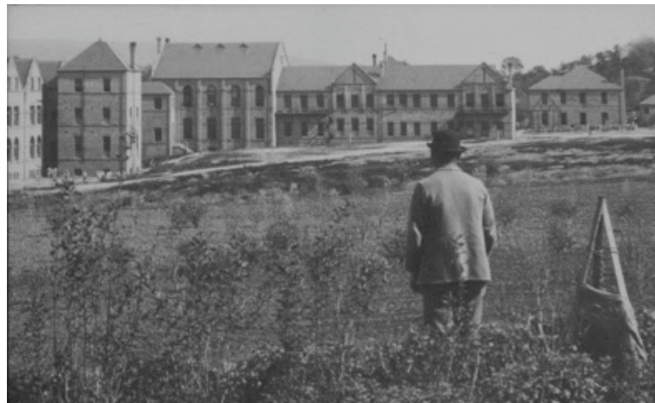
Main buildings, approximately 1900