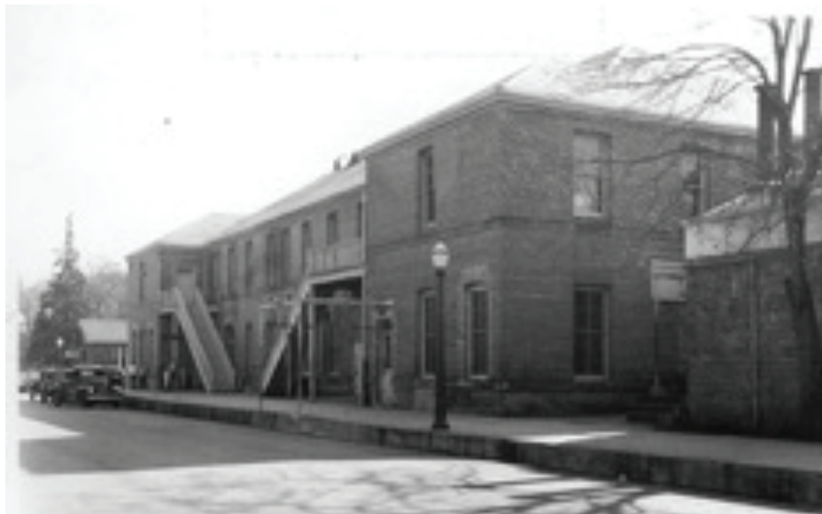
Madrona, approximately 1950