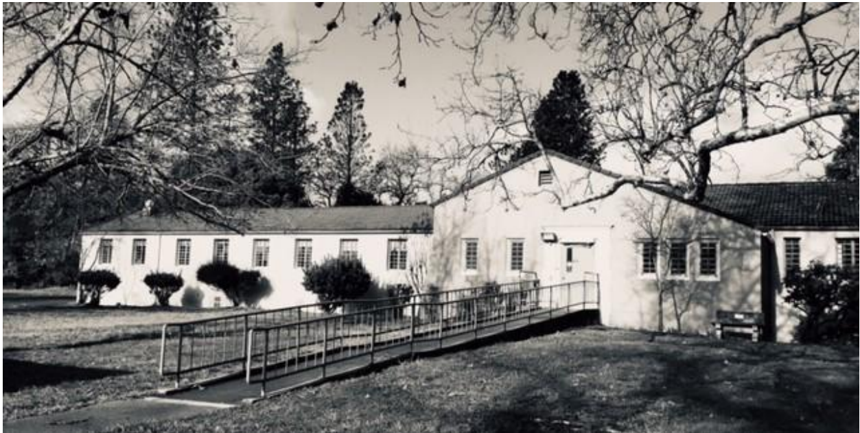
Cohen residential building at SDC

The project can start with one or two buildings and can grow as demand increases. Preference for this affordable co-housing cannot legally be given to Sonoma County residents exclusively; applicants from outside the County cannot be turned away. But marketing can be focused locally. Ideal residents would be individuals and families who are working in the surrounding communities of Glen Ellen, Kenwood, Santa Rosa, and Sonoma Valley. By providing housing to local workers, traffic congestion for commuters to local jobs and greenhouse gas emissions would be reduced. Many individuals and families in the county are employed yet cannot afford the going rents or tolerate a long commute. These will be the easiest to house at SDC and are the basis for our financial plan.