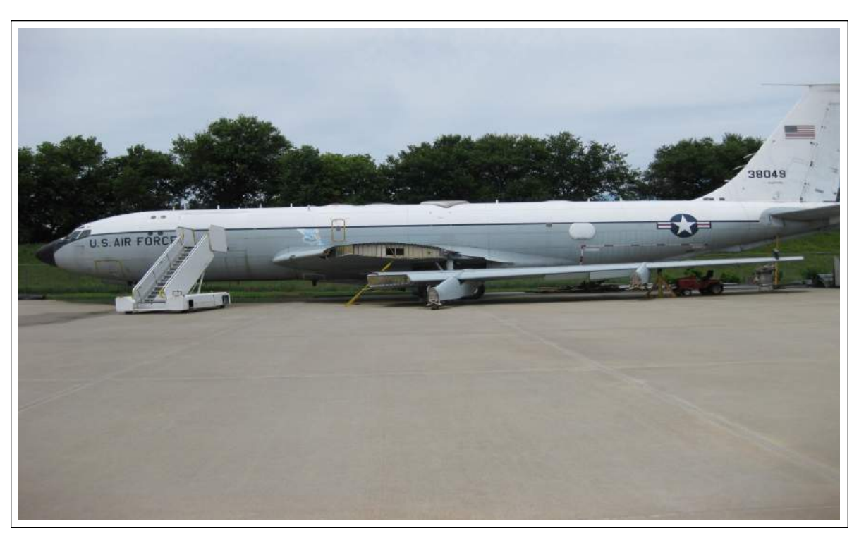
EC-135C, No. 63-8049 - SAC & Aerospace Museum (Now Undergoing Restoration) S. Leazer