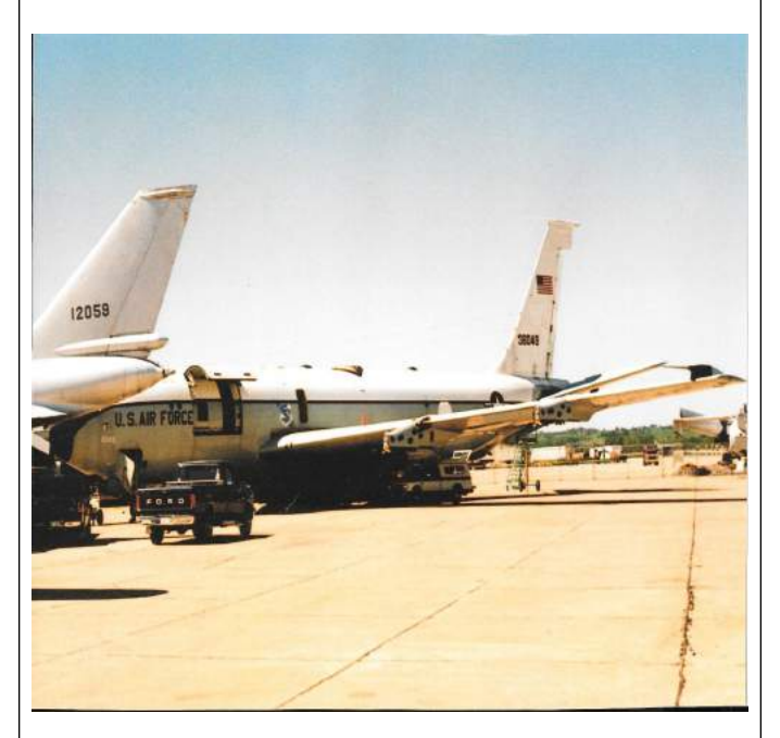
move to the new facility in Ashland, NE W. Curtis - July 1997

Photo of 63-8049 at SAC Museum in Bellevue prior to the