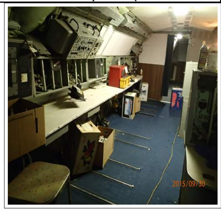
More recent progress in the Battle Staff Area and Radio Compartment