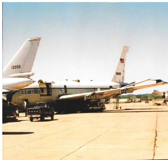
move to the new facility in Ashland, NE W. Curtis - July 1997

Photo of 63-8049 at SAC Museum in Bellevue prior to the