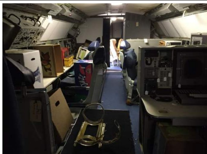
Early Stages of Work in the Battle Staff Compartment