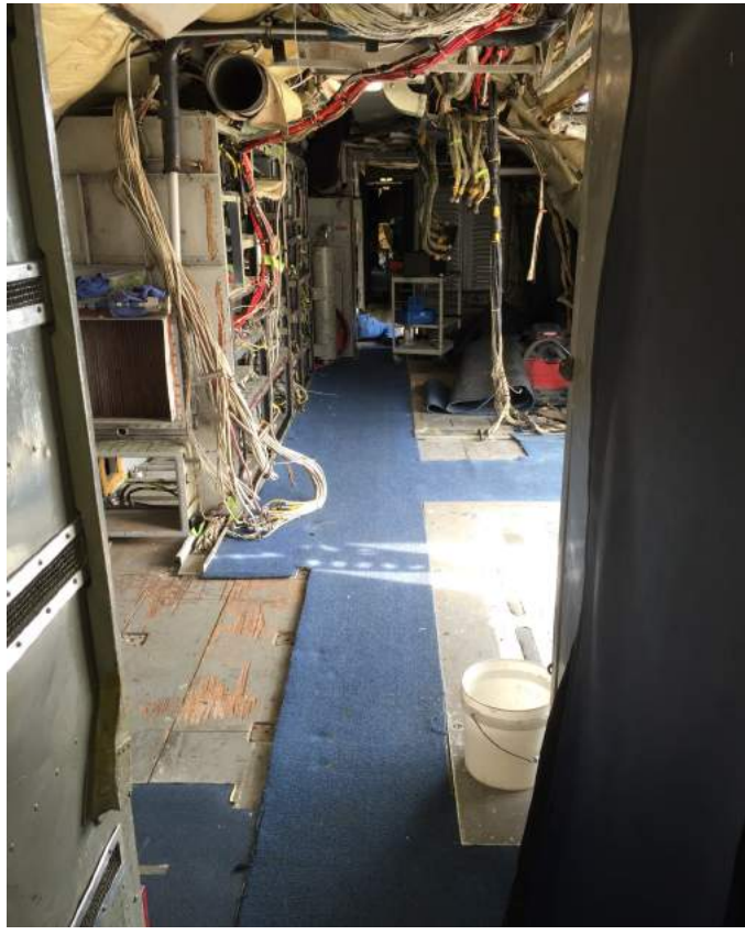
Looking aft from cockpit door