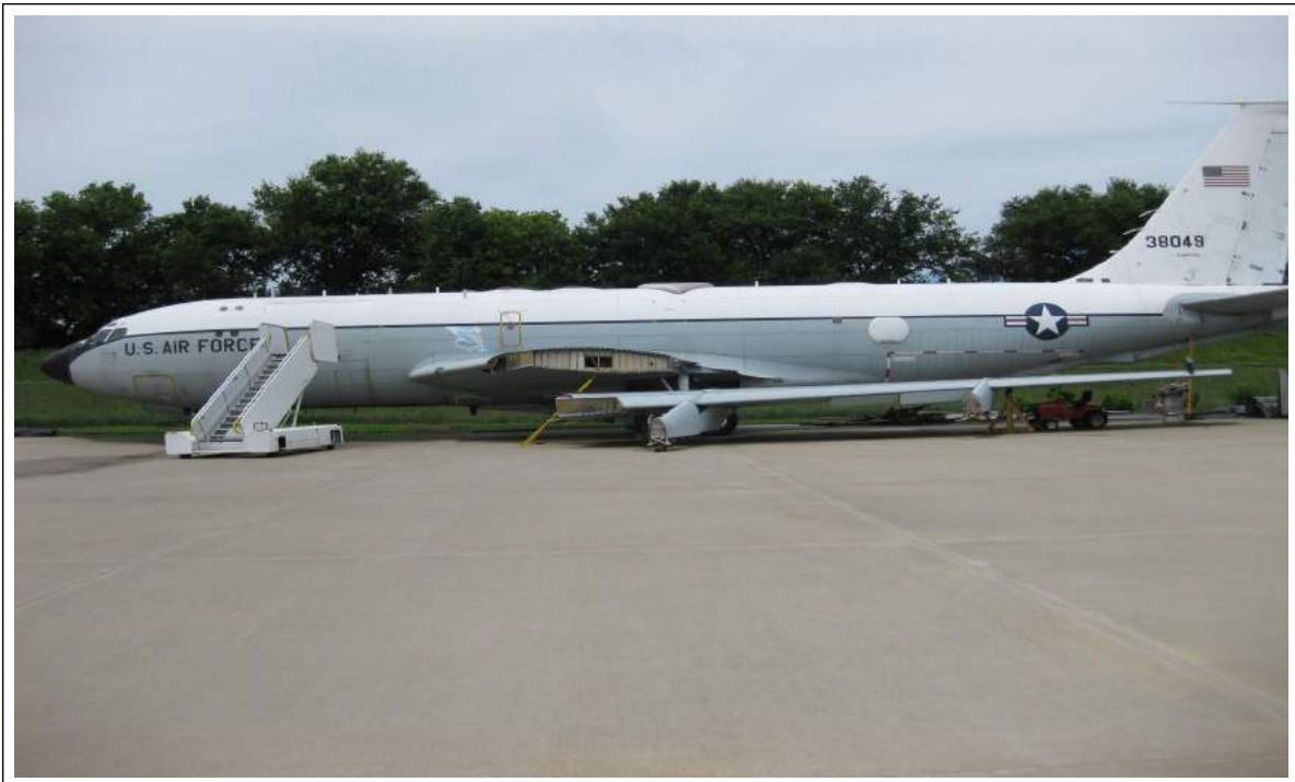
EC-135C, No. 63-8049 - SAC & Aerospace Museum (Now Undergoing Restoration)