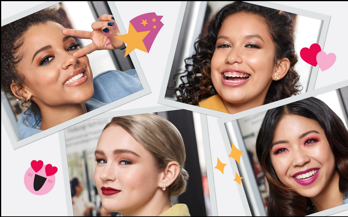
Sephora Prom Campaign