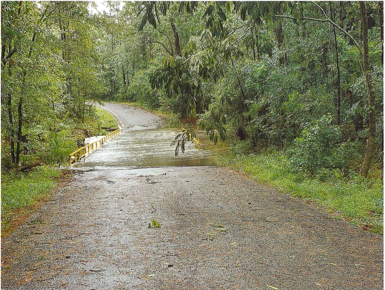
Hurricane Beryl – July 8, 2024