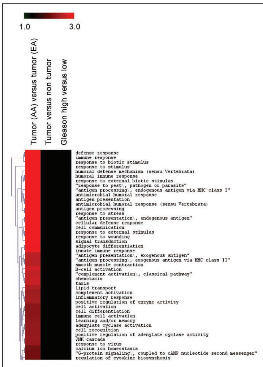
Figure 1. GOBP terms that are uniquely enriched for differently expressed genes comparing prostate tumors from African-Americans (AA; n = 33 ) with tumors from European-Americans (EA; n = 36 ). For comparison, we also show the contrast of tumor ( n = 69 ) versus nontumor ( n = 20 ) and the contrast of high ( n = 51 ) versus low ( n = 18 ) Gleason sum score. Gleason sum score was dichotomized into high (having a sum score of 7–9) and low (having a sum score of 5–6). The results of our analysis are displayed by a heat map with the red color indicating an enrichment of differently expressed genes in a GOBP term.

genetic pathways that are linked to autoimmune diseases, allergies, and inflammatory diseases (Supplementary Fig. S1). The enrichment of disease genes among the differently expressed genes was statistically significant, e.g., inflammatory urogenital disease genes (permuted P < 0.001 ), skin-prick test genes (permuted P = 0.003 ), systemic lupus erythematosus genes (permuted P = 0.006 ), and asthma (permuted P = 0.01 ). Autoimmune disease modulators, such as PTPN22 and components of the HLA complex, and key genes in antigen presentation, such as TAP1 and TAP2 , were higher expressed in African-American tumors. In contrast, genes differently expressed between tumor and nontumor tissue, and between tumors with high and low Gleason sum score, showed common associations with other epithelial cancers as one may expect (Supplementary Fig. S1).