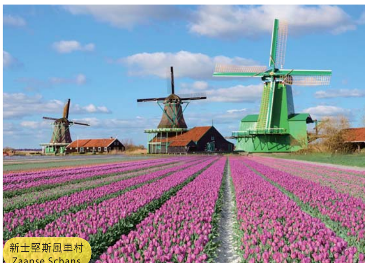
新士堅斯風車村 Zaanse Schans

Coach to Brussels. Situated between France and the Netherlands, Belgium encompasses all the best that Europe has to offer. Admire the architecture dotting the cobblestone squares. Photographing the Grand Place, Manneken Pis, etc. is a "must". On board the Euro Star train, all arrive London in late afternoon. (B/D)