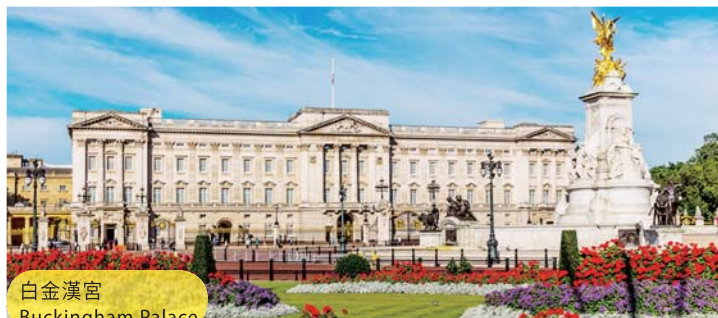
白金漢宮 Buckingham Palace

Upon arrival, all will visit the famous Louvre Museum to appreciate the immortal painting of Mona Lisa. Next stop is the Montmartre Hill, known for the white-domed "Vincent Van Gogh". This is followed by an optional cruise on River Seine, which is highly recommended as another way to discover Paris. A French banquet dinner will be a unique experience for all. (D)