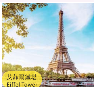
艾菲爾鐵塔 Eiffel Tower

Depart from home city for Paris, the capital of France.