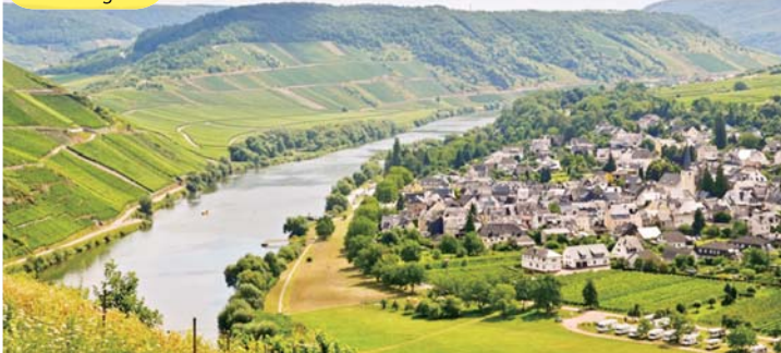
萊茵河區 Rhine Region