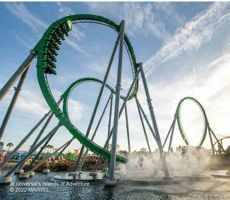
at Universal's Islands of Adventure © 2022 MARVEL

In Universal Studios Florida , discover mischief and mayhem with Illumination's Minions, team up with the Transformers, experience the cutting-edge fusion of stagecraft and jaw-dropping thrills at the Bourne Stuntacular.