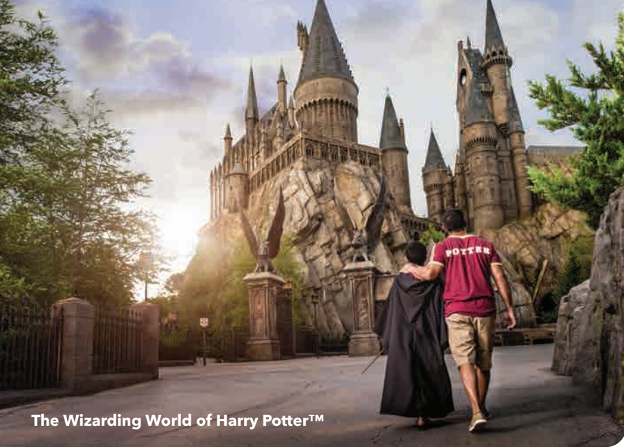
The Wizarding World of Harry Potter™