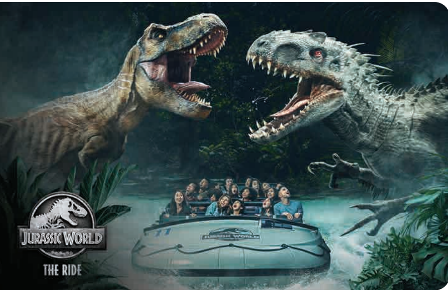
JURASSIC WORLD THE RIDE