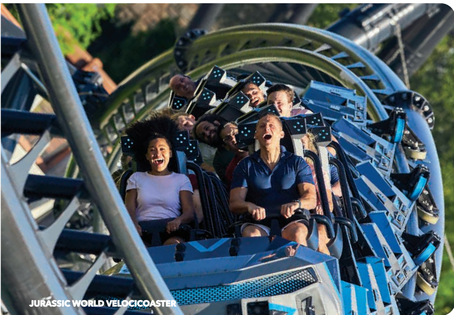
JURASSIC WORLD VELOCICOASTER