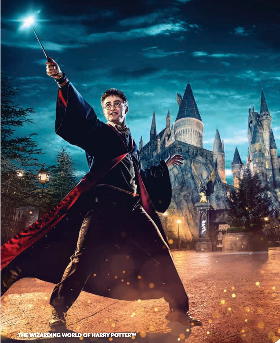
THE WIZARDING WORLD OF HARRY POTTER™