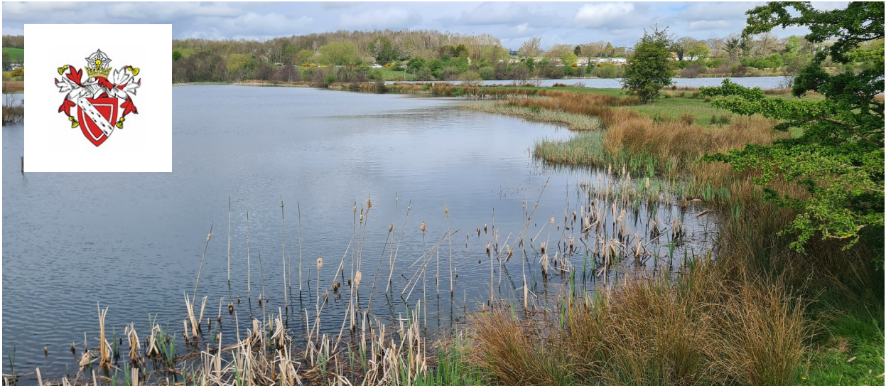
The new fishing lakes.