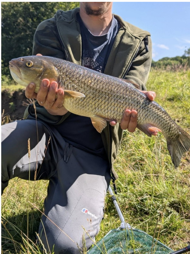
Nice chub caught recently.