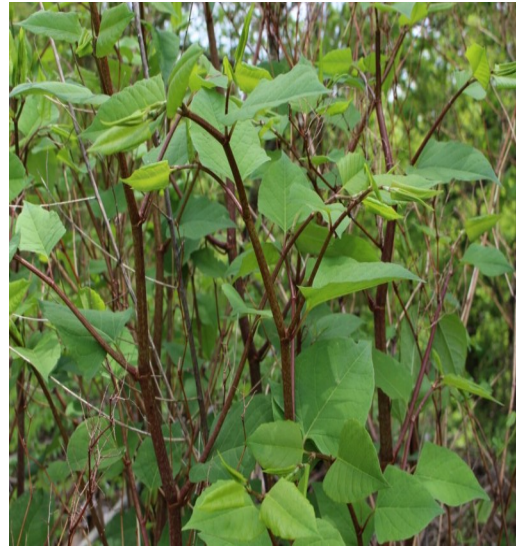
Japanese Knot Weed