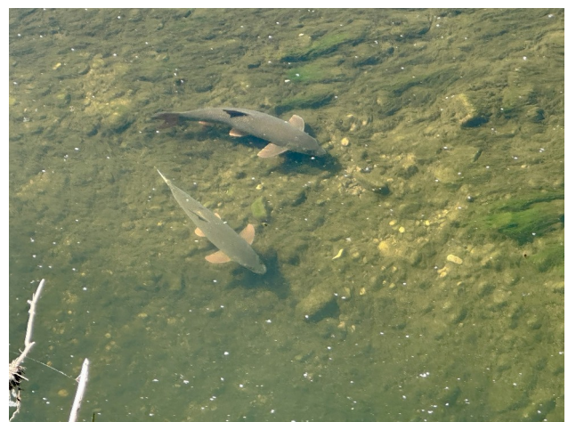
Swale barbel (RADAS waters)