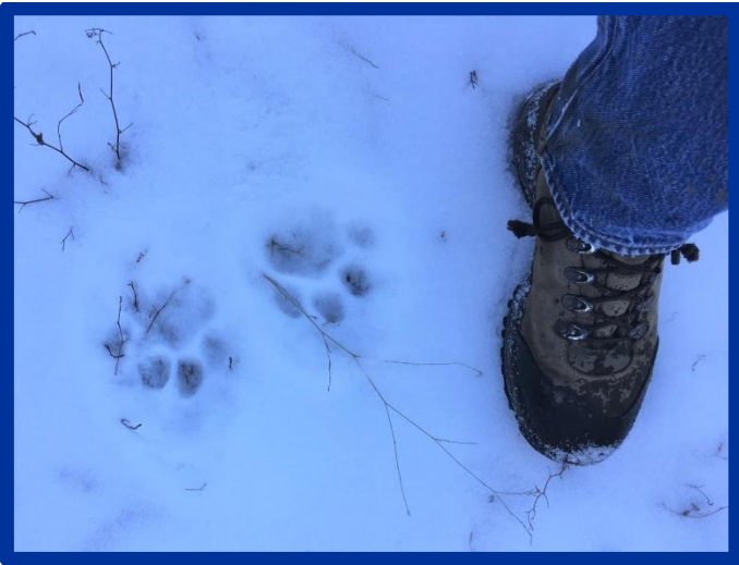
Mountain lion tracks found above the Ranch in December. The boot is a size 11. You can imagine the size of the animal!