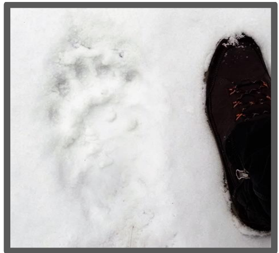
Bear track found above Dale Creek Road also in December. You never know what's out there!