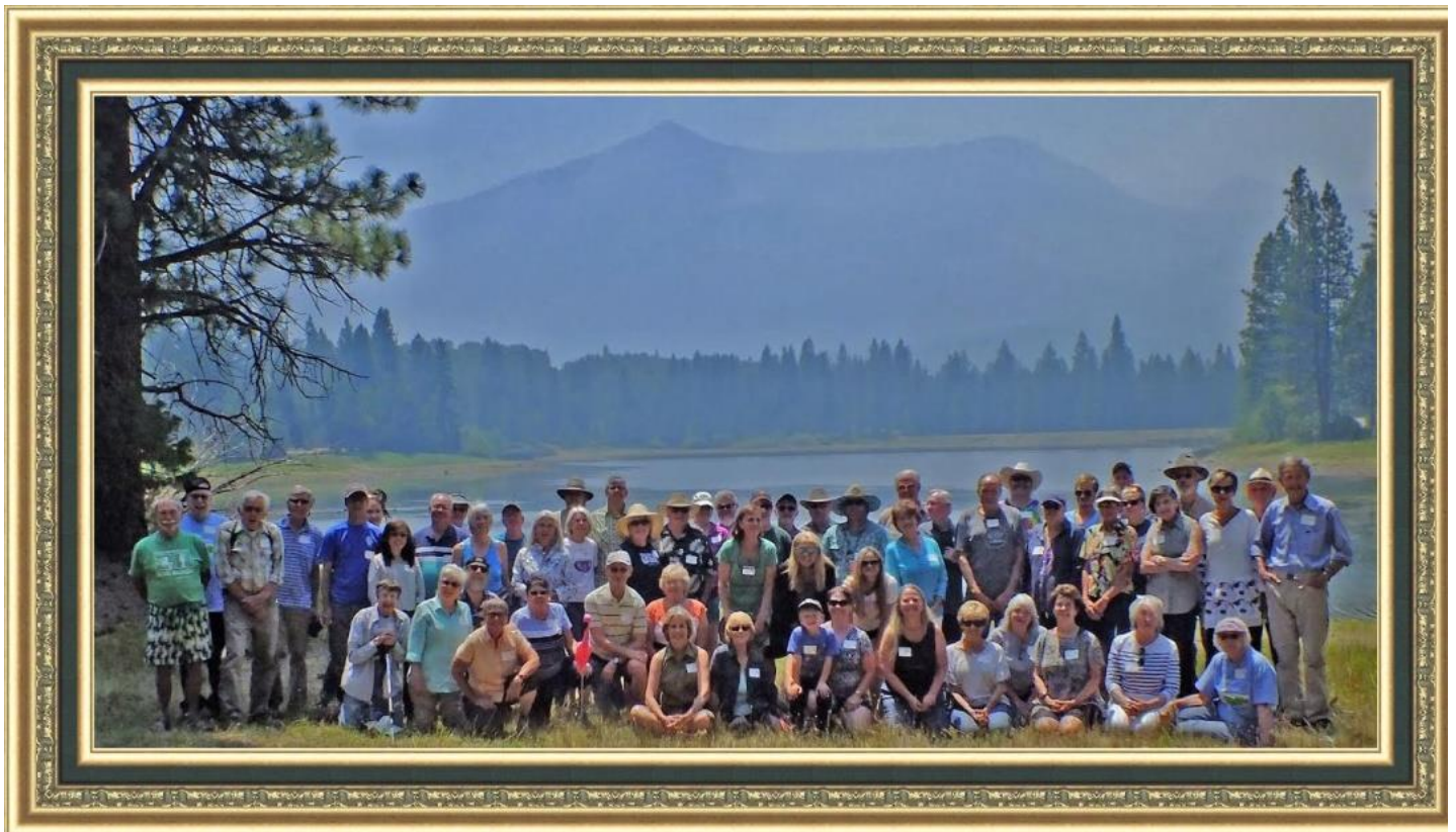
The Whole Picnic Gang