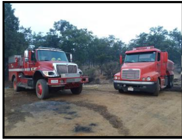
CalFire & HRFC Watertender