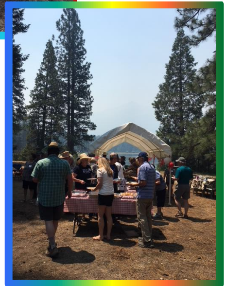
Lunch is Served!