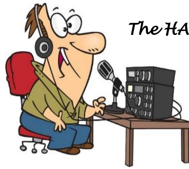
The HAMS Among Us!

The Mt Shasta Amateur Radio Club offers free training and testing for anyone who wants to become licensed as a ham. Technician level classes in 2020 will be held at their clubhouse beginning in late January or early February.