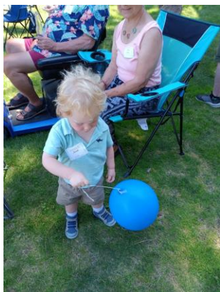
Balloons were a big hit