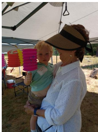
And the hanging lanterns