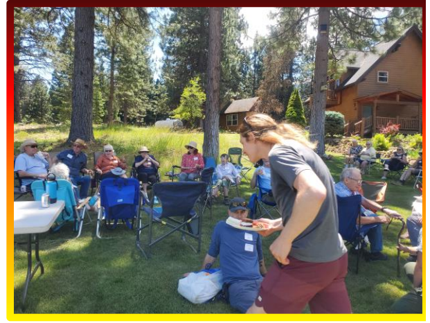
Lunch in the Shade