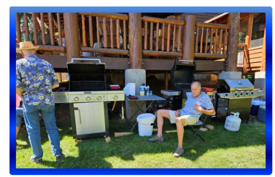
Hard working cooks!