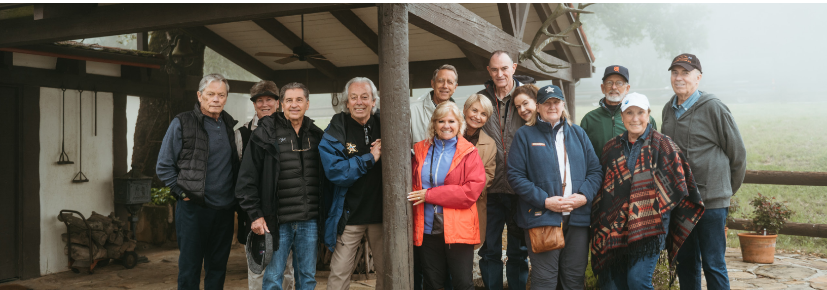
Former United States Secret Service special agents enjoy a memorable reunion with family and friends at Rancho del Cielo, where they helped protect President Ronald Reagan.

The group toured the adobe house, tack barn, hay barn, and Secret Service Command Post, followed by a mechanized "trail ride" throughout the 688-acre Ranch. Each agent recounted stories from their time on duty with the Reagans, including the drive up and down Refugio Road, tacking up horses, horseback riding, brush-clearing, Queen Elizabeth's visit, Ranch intrusions, pranks played on the President and by the President, and President Reagan's quintessential storytelling.